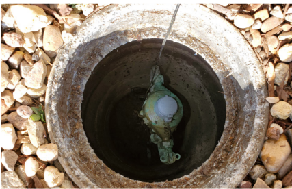
Photo of a water meter that is located in a pit in the front yard.

Water meters are used to measure how much water you use. The water meter attached to your home registers the water that flows through it. ECCV bills each customer based on actual water used.