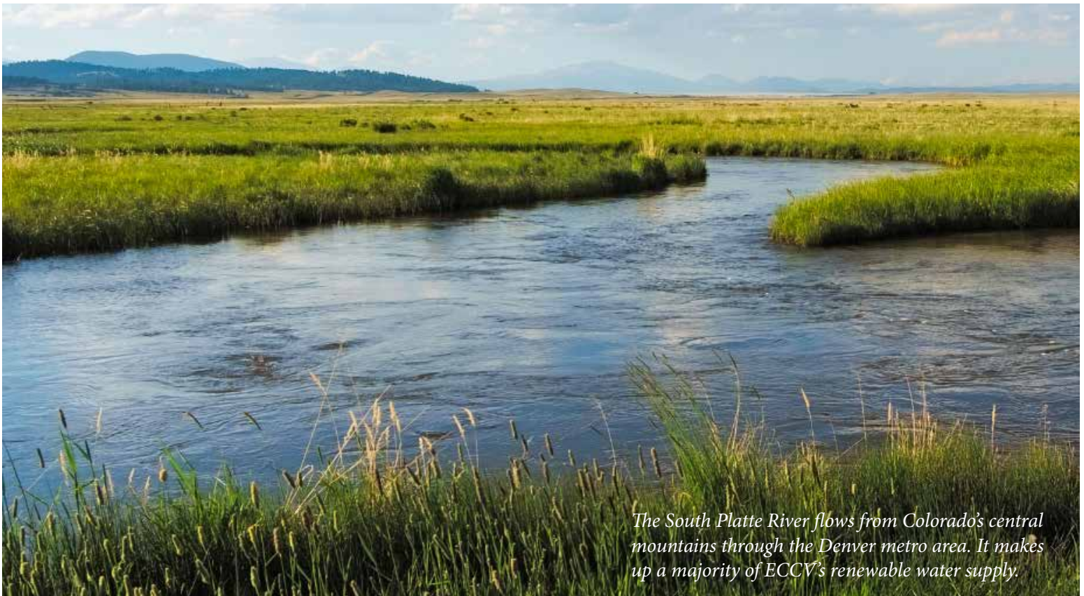
The South Platte River flows from Colorado's central mountains through the Denver metro area. It makes up a majority of ECCV's renewable water supply.

Potential sources of contamination in our source water area come from commercial and industrial activities such as leaking underground storage tanks. The Source Water Assessment Report provides a screening-level evaluation of potential contamination that could occur. It does not mean that the contamination has occurred or will occur. ECCV can use this information to evaluate our current water treatment capabilities and prepare for future contamination threats. This can help ECCV ensure quality water is delivered to your home. In addition, the source water assessment results provide a starting point for developing a source water protection plan.