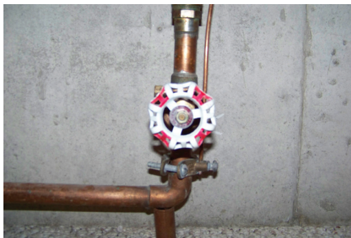
Master shutoff valves are typically located close to where water pipes enter the home. This is often near entryways, but may also be in basements.